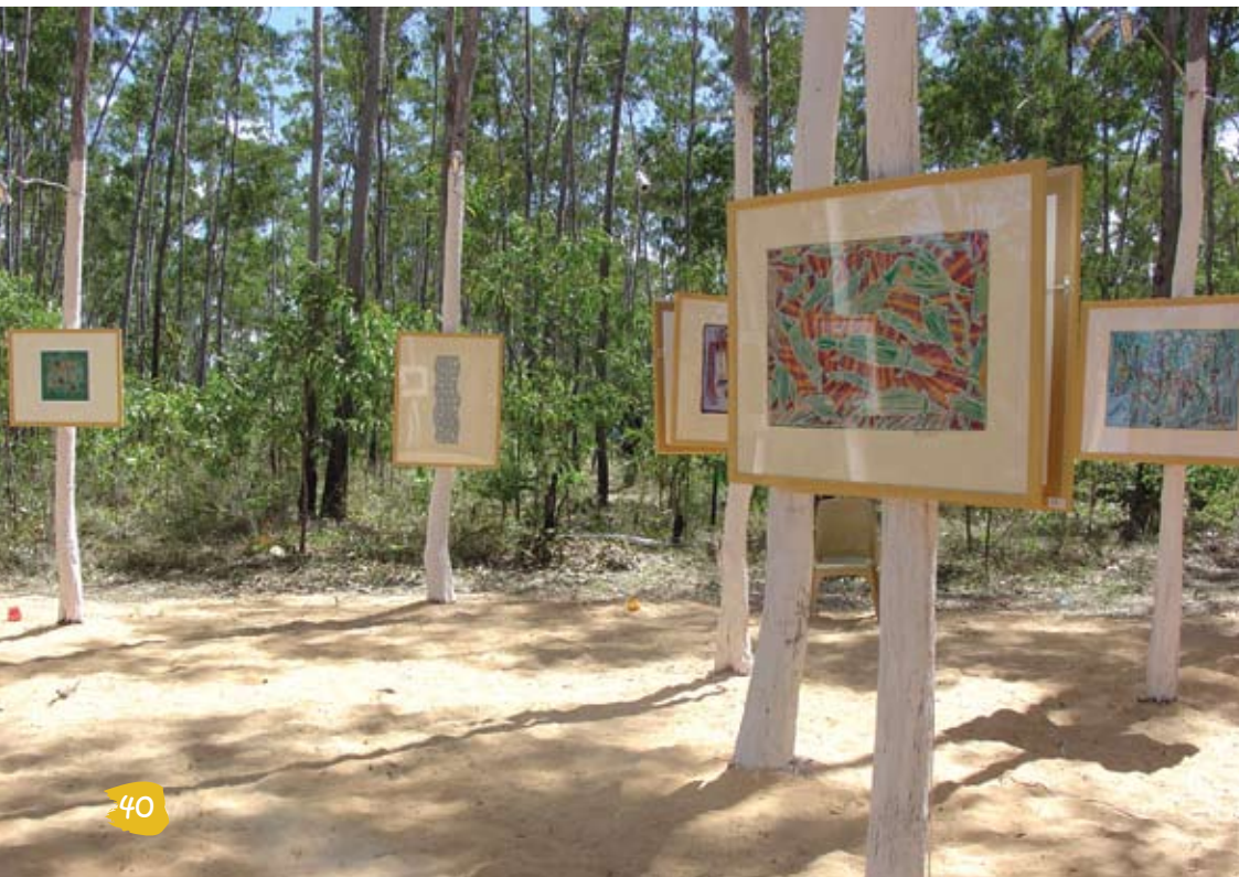
The open air Gapan Gallery

The scope of Industries include Rangers, Security, Retail,