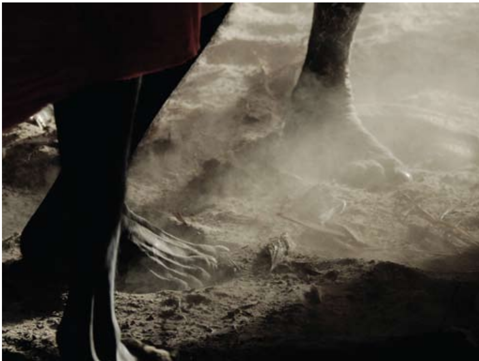
Rio Tinto Alcan