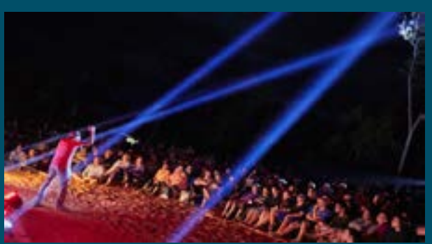
A night of comedy under the stars