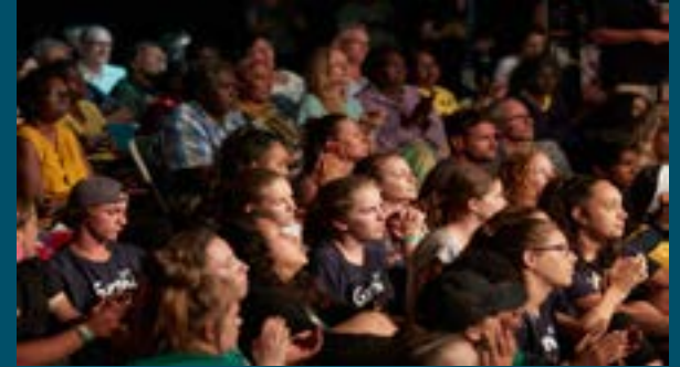
A blend of youngsters and the elderly watch on

https://www.theguardian.com/australia-news/2017/aug/04/ indigenous-students-at-garma-festival-detail-challenges-ofattending-mainstream-schools