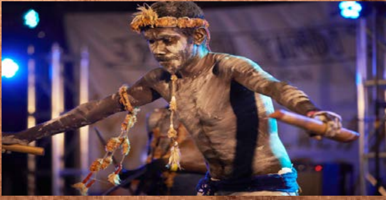
Traditional dress of a Yolngu performer

For another volunteer at this year's festival, it was about making a small contribution to a festival that puts "Indigenous issues at the forefront of the national political conversation for at least a few days."