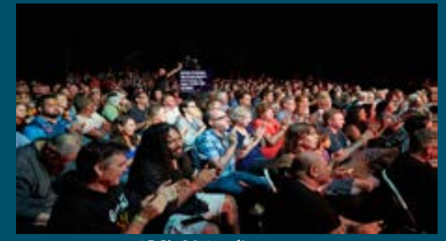
ABC's Q&A audience