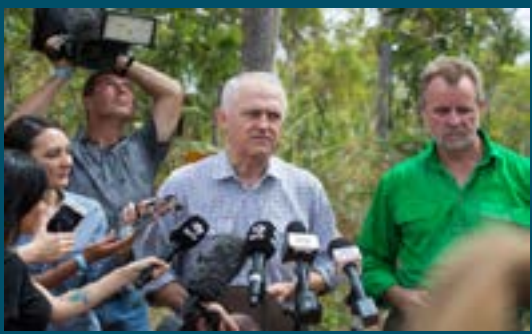
Prime Minister Malcolm Turnbull and Minister for Indigenous Affairs Nigel Scullion addressing Garma media.

http://www.sbs.com.au/nitv/nitv-news/article/2017/08/02/ australian-leaders-under-pressure-garma